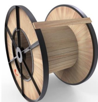
Iron wooden reel

Wooden reel: outer retaining recommended, inner retaining or groove retaining available.